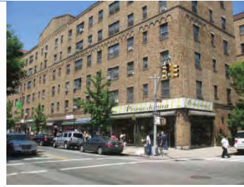
37th Avenue & 81st Street