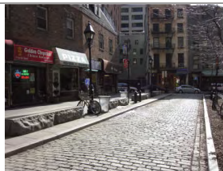
Stone Street - Manhattan