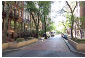
West 94th Street - Manhattan

Local street with significant traffic calming Discourages vehicle through traffic