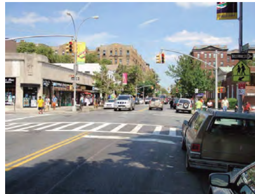
78th Street: Commercial