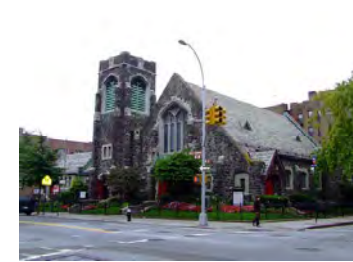
Community Methodist Church - 35th Ave