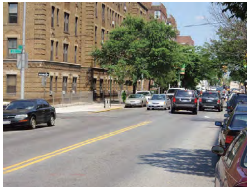
71st Street: Residential