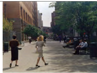
Metrotech - Brooklyn

Full day or part-day vehicle restrictions Exclusively for pedestrians