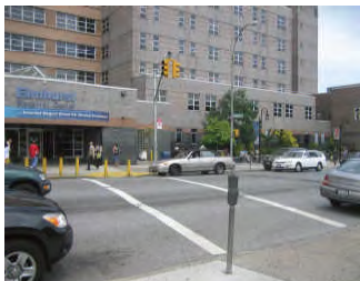
Elmhurst Hospital - Broadway