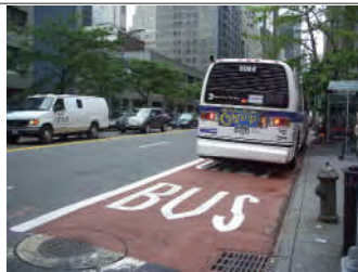
34th Street - Manhattan