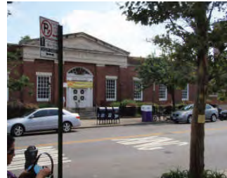
U.S. Post Office - 37th Avenue