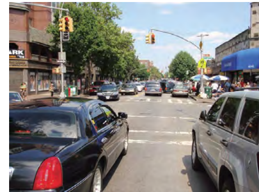
82nd Street: Commercial