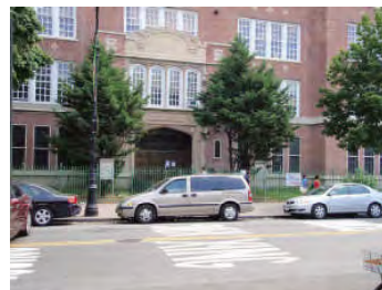
P.S. 69 - 37th Avenue