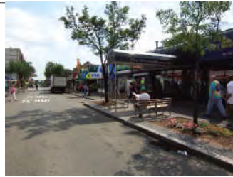
46th Street - Queens