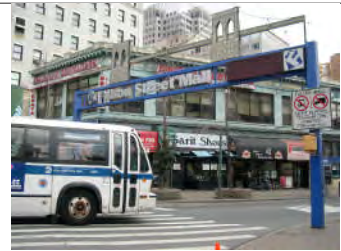
Fulton Street Mall - Brooklyn

Private vehicles have limited or no access Street may be exclusively for surface transit (bus)