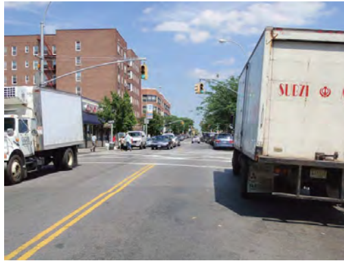
73rd Street: Residential/Commercial